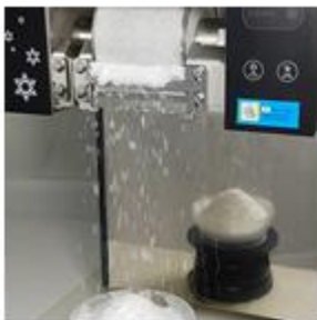
High ice production capacity of up to 250 kg per day