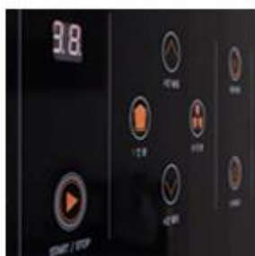
Touch panel with automatic timer for one touch operation