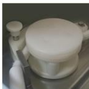
Suction Pump and sensor for automatic ingredient input