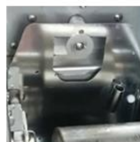
Automatic tray lift