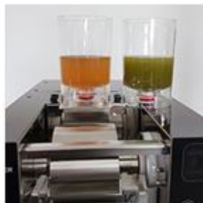
Easy to change flavors by varying the input containers