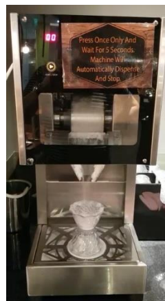
3. Machine dispenses snow ice flakes