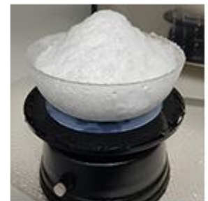
Optional turn table system