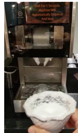
4. Enjoy your snow ice flakes