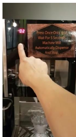
2. Press the start button