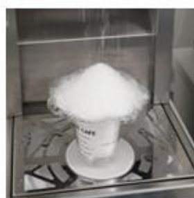
Automatic turn table for properly shaped ice