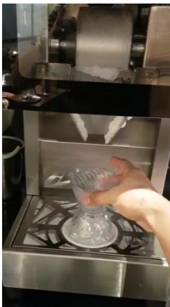
1. Place the cup at the turntable

One touch dispensing feature for buffet and self-service concept